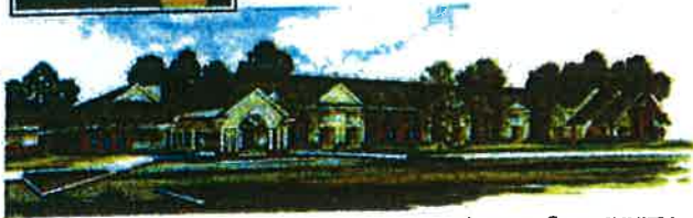
GRAND LEDGE'S FINEST RETIREMENT LIVING COMMUNITY

4775 Village Drive Grand Ledge, MI 48837 (888) 826-7118 www.seniorvillages.com